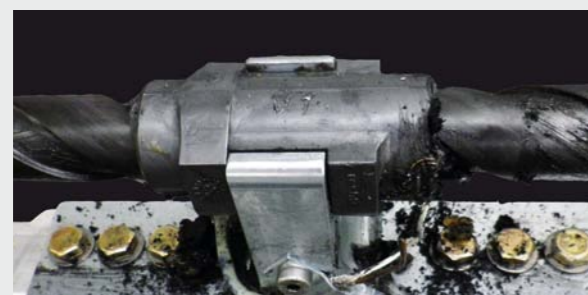
Conventional well-proven IFE screw drive