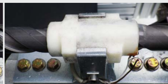
New lubrication-free IFE screw drive